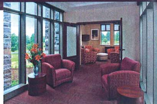
TOP + ABOVE Designers with Glavé & Holmes incorporated Virginia Tech's trademark colors into its visitor center through the use of subtle color variations in carpeting, upholstery and surfacing materials.